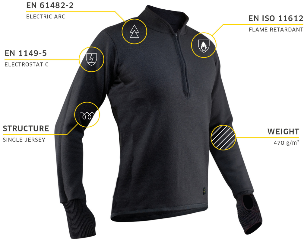
THERMAL zip neck - GP 277 241 A 950A

DEVOLD® THERMAL - made from 98 % pure new wool and 2% Nega-stat®. The wool provides good protection against cold, radiant heat and flames, while the Nega-Stat® provides an optimal antistatic protection. With Devold® Thermal, you keep warm even at rest, since wool can absorb significant amounts of moisture without feeling wet. Devold® Thermal is user-friendly with side panels, and thumb loops to maximize protection and isolation. Wool does not melt, and Devold® Thermal is Zirpro treated to give extra flame retardant properties.